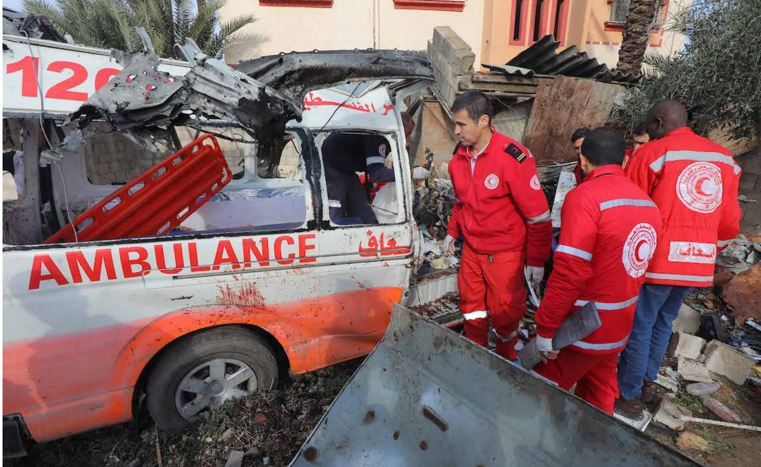
An ambulance belonging to the Palestinian Red Crescent Society (PRCS) was bombed.