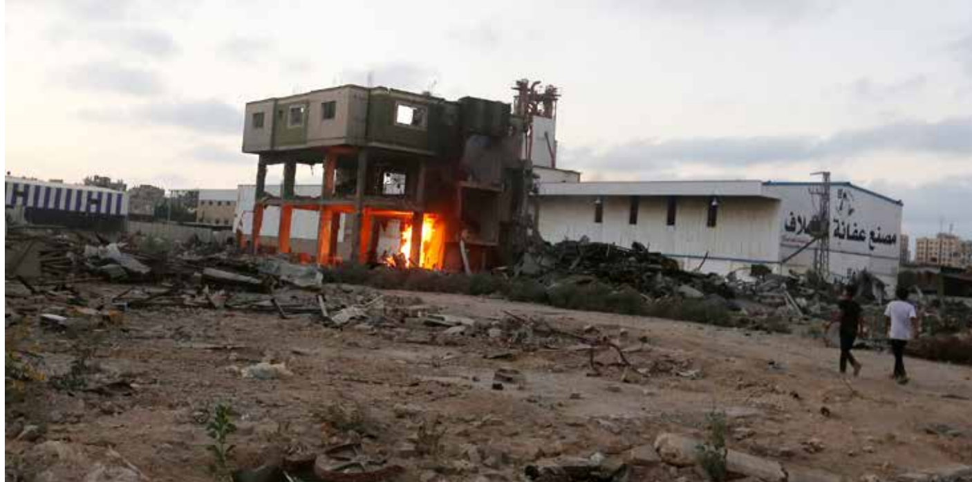
● ● Feed factory in al-Zawida area in Deir al-Balah, central Gaza Strip. ●

This devastation has left more than 4,000 fishermen, many from Gaza City and northern Gaza, without their primary source of income, stripping them of the ability to support their families. The task of rehabilitating the sector appears nearly impossible, especially given the ban on the entry of fishing materials and equipment.