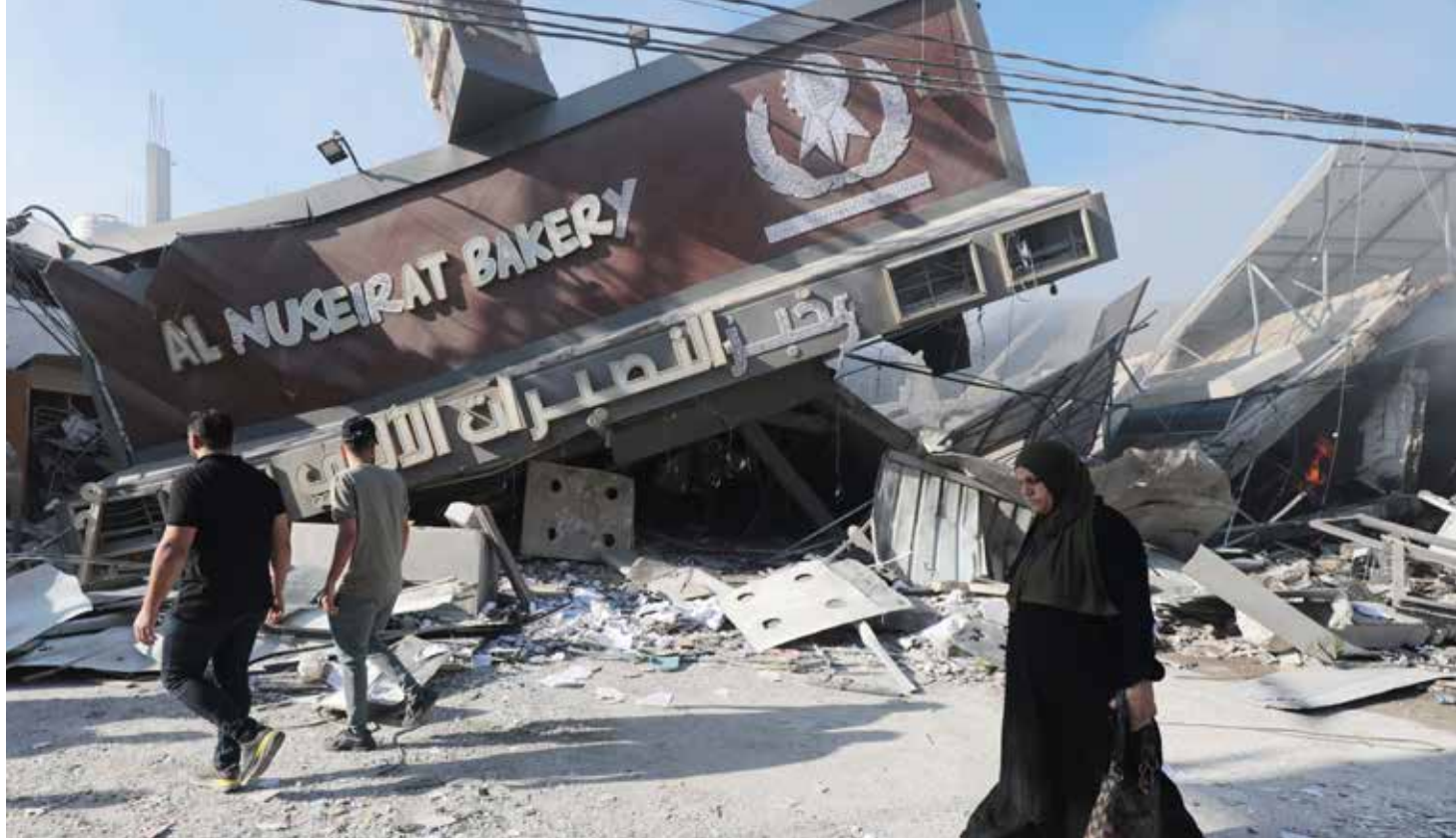
● A bakery destroyed in an Israeli airstrike on al-Nusirat refugee camp. ●

● is no more than half a loaf in the morning, and the only available food is rice. When aid reaches northern Gaza, which ● includes flour—if the IOF allows it to enter—it is distributed at a very dangerous point (Roundabout 17), where many men ● have been killed at that moment. We cannot risk the lives of my husband and son for an uncertain loaf of bread. Later, ● the food crisis worsened drastically, as rice and flour disappeared from the markets, forcing us to survive on one meal a ● day and make bread from animal feed as a means of survival. I have lost 25 kilograms of my weight, having spent many ● days without food. I feel severe fatigue and constant helplessness, as I find myself unable to feed my children as I used ● to. I dream of the moment when I can sleep deeply after satisfying my children with food. I hope for the day when we ● can return to our normal lives, where my children have the food and security they need. Many times, I am overwhelmed ● by fatigue from the extreme hunger and sorrow over what has become of us as innocent civilians. What wrong have we ● committed to endure this suffering? ”