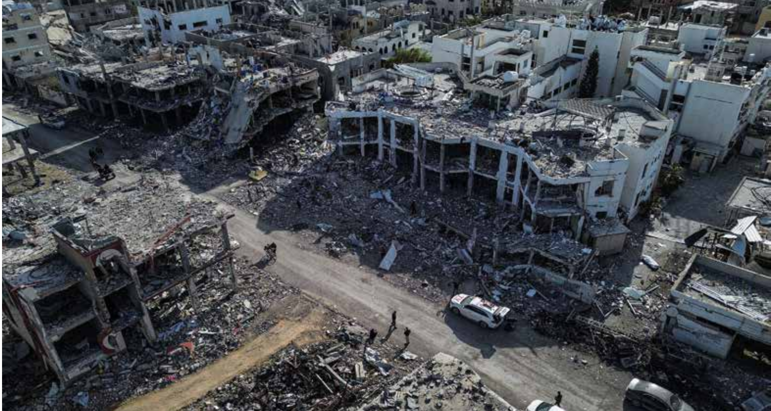
● The damage to Abu Yousef al-Najjar Hospital and its surroundings in Rafah. ●