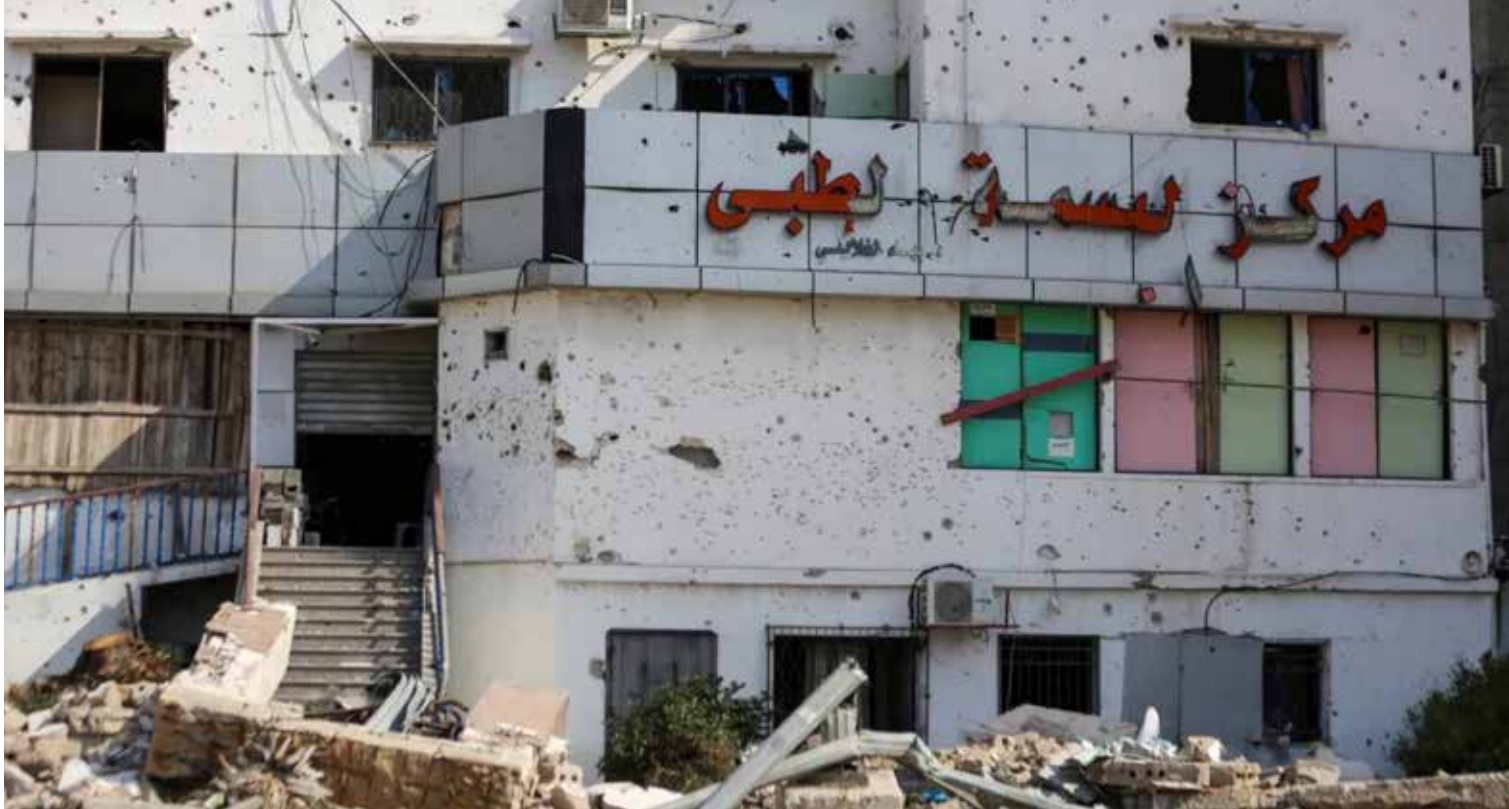
● The damage caused by the targeting of Al-Basma Medical Center in Gaza City.