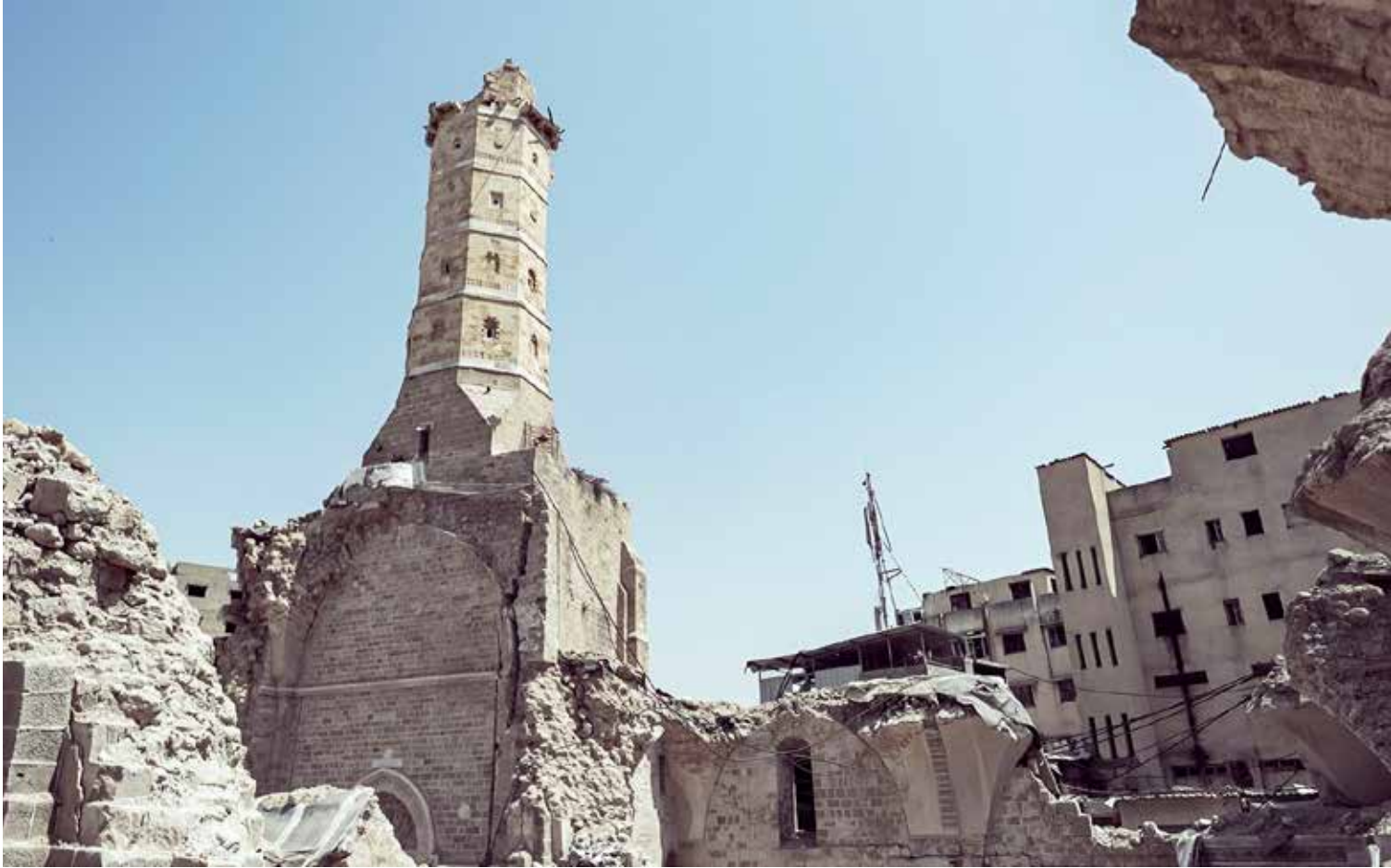
• The damage to Al-Omari Mosque in Gaza City.

“ The Omari Mosque is not just a place of worship; it is part of Gaza’s long history of learning, culture, and faith. It was a central gathering point for Gazans, especially during Ramadan nights, when it would be filled with worshippers. We also held ceremonies there to praise the Prophet Muhammad and dhikr sessions. Now, with the mosque destroyed, we are deprived of our spiritual and cultural practices. This loss is not just physical; it is a deep spiritual wound for our community.”