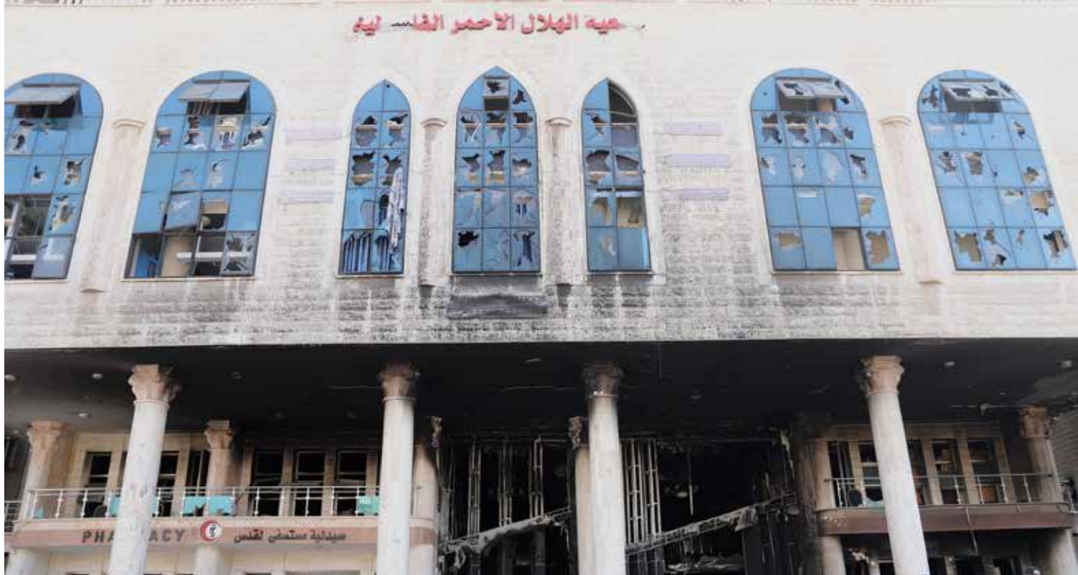
● The Palestinian Red Crescent Society (PRCS) Hospital in Gaza.

Hospitals and healthcare centres in the southern Gaza Strip were also not spared by the IOF, including the Nasser Medical Complex in Khan Younis – Gaza’s second-largest medical facility, as well as Al-Amal Hospital run by PRCS. The IOF deliberately besieged those hospitals several times before evacuating and bombing them and sniping their medical personnel in addition to hindering the movement of ambulances. As a result, the provision of all medical services for patients and injured was delayed and dozens of them were arrested. 214