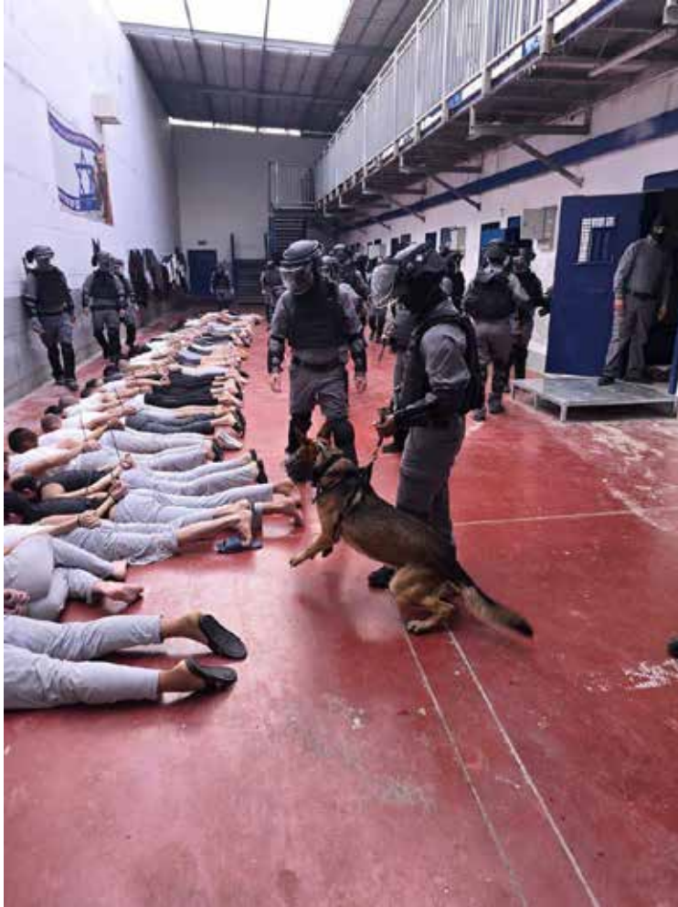
● ● Palestinian detainees in an Israeli detention center. ●

Additionally, a released detainee, Ismail Qarmout, reported the following: