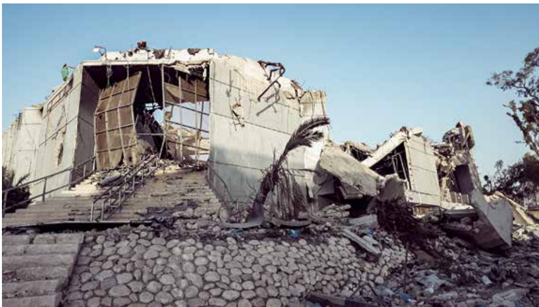
● The damage to ● Rashad Al-Shawa ● Cultural Center ● in Gaza City.