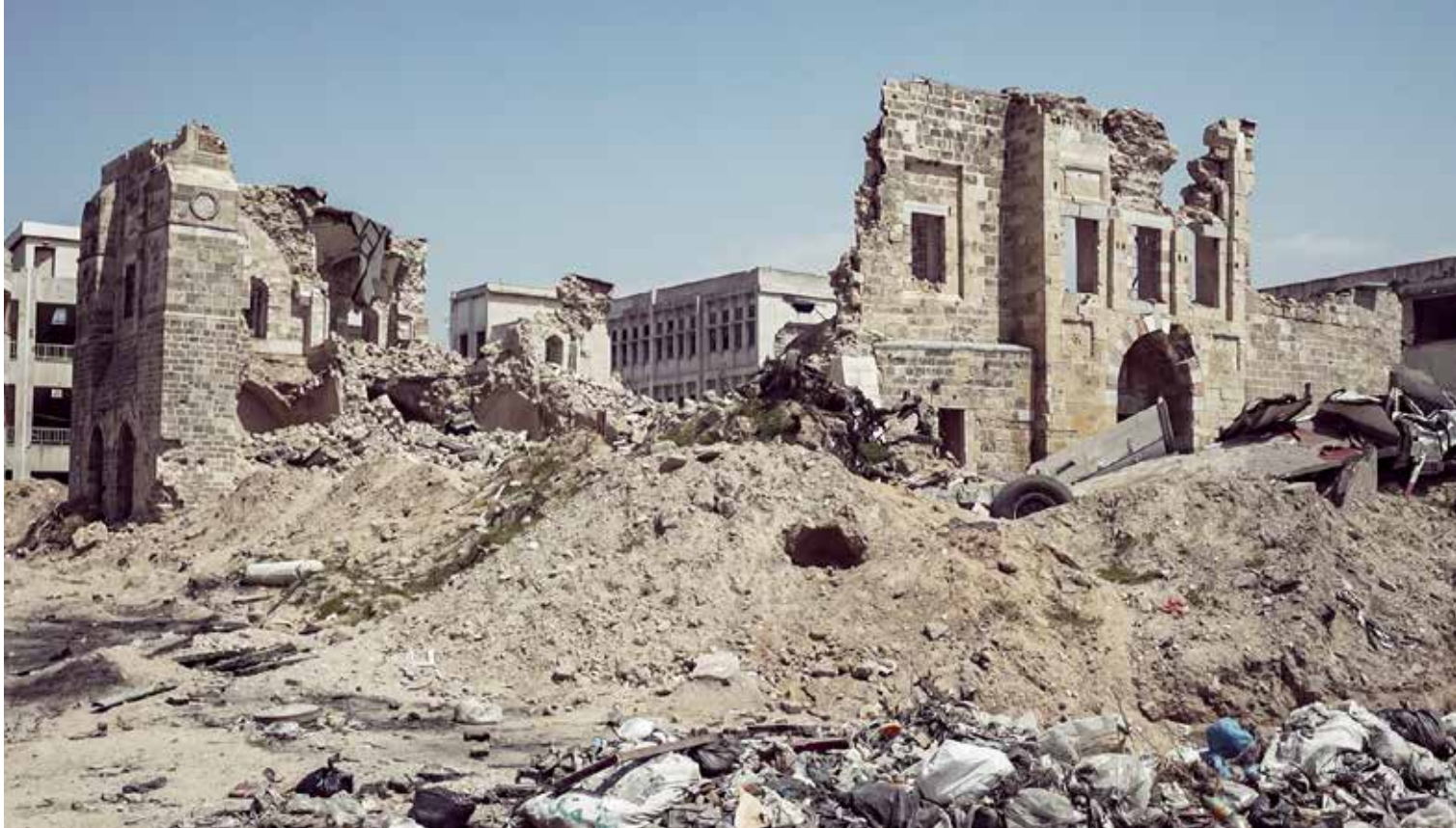
● ● The damage to the historic Al-Pasha Palace in Gaza City. ●