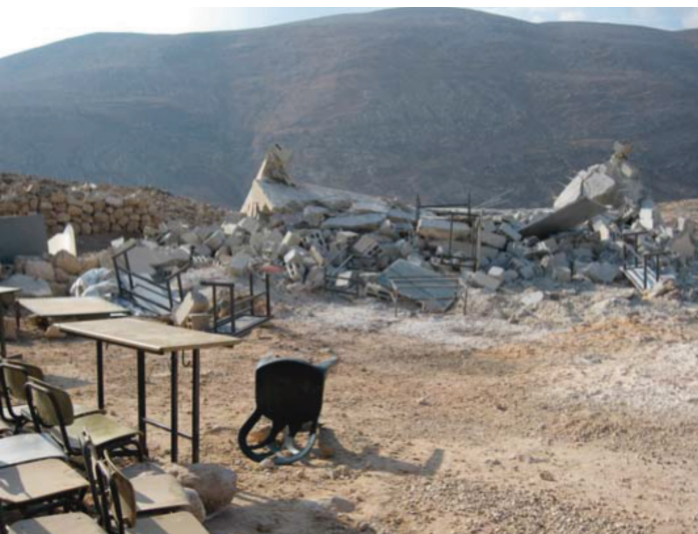
Remains of the Khirbet Tana school, demolished by Israeli forces in December 2010.

In addition, the availability of education services is usually another issue of concern for families following forced displacement, as indicated by Save the Children UK. 28