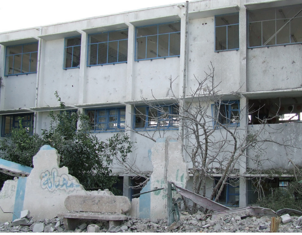
UNRWA Elementary School, Rafah (Gaza Strip), January 2009.

that 100 schools need to be built to accommodate new students of all grades in the coming three years. To-date, the agency has only received permission from the Israeli authorities to build 20 schools. 40 However, permission to build is no guarantee that construction can take place. There is no certainty as to when adequate building materials will be made available in Gaza, given the length of the overall import process and the availability of only one operational commercial crossing (Kerem Abu Salem) for all types of goods. 41