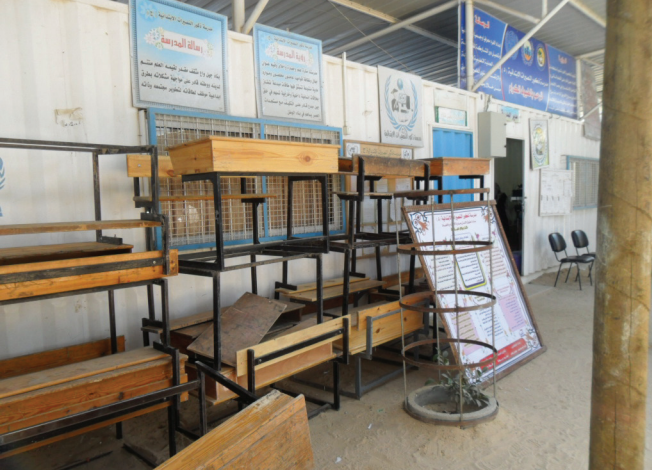
Lack of Space. Desks and chairs piled in the courtyard of UNRWA Elementary school, Nuseirat Refugee Camp, Gaza Strip, June 2011.