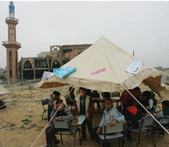
Students from Dar al-Fadila primary school, near Rafah (Gaza Strip), attend lesson in tents set up near the destroyed building, January 2009