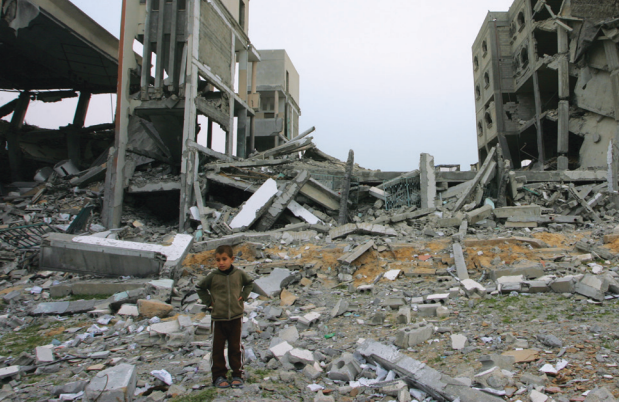
Dar al-Fadila primary school, near Rafah, Gaza Strip, January 2009.