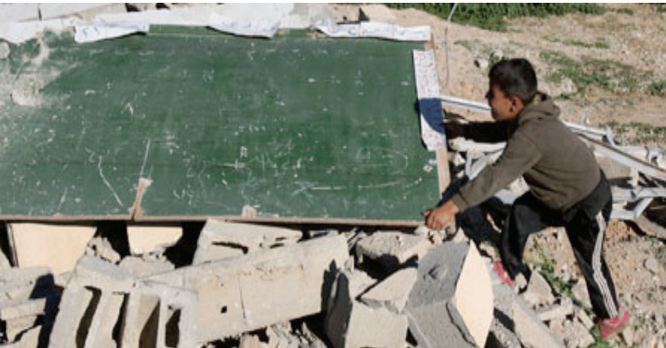
A Palestinian child holds a board of a classroom, demolished by Israeli forces, in Khirbet Tana near Nablus, January. 10, 2010.

Overall, these factors contribute to increasing the psychosocial distress of school children and are responsible for increasing drop-out rates and low learning outcomes.