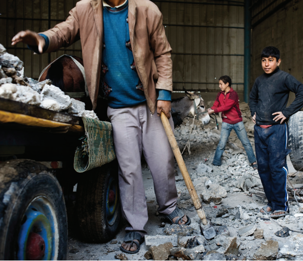
Child working as rubble collector, Gaza Strip, December 2010.

have been registered across primary, preparatory and secondary levels as result of a number of factors, including conflict-related mental distress, closure-related poverty and the need to help families by working. 77