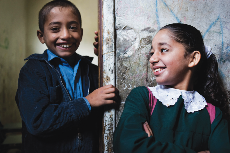
Gaza schoolchildren, December 2010