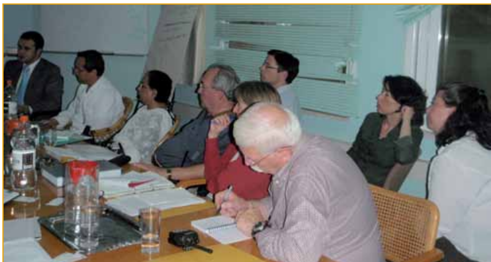
UN Fact Finding Mission on the Gaza Conflict and PCHR June 2009