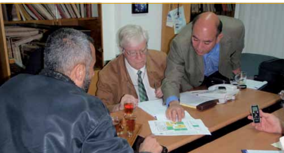
Independent Fact Finding Mission interview victim Feb 2009