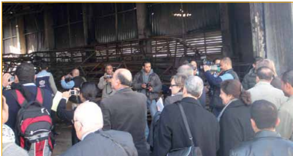
Independent Fact Finding Mission survey destruction to UNRWA warehouses, Feb 2009