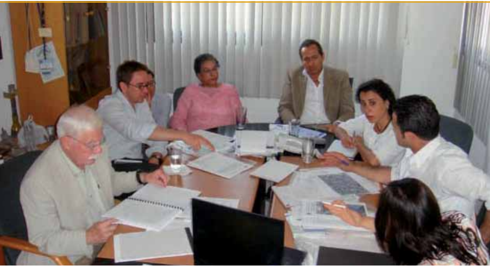
UN Fact Finding Mission in PCHR's offices June 2009