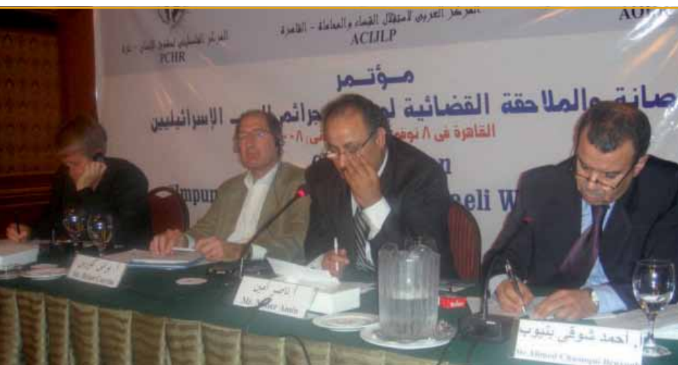
Panel on Transitional Justice, Universal Jurisdiction Conference Cairo, November 2008