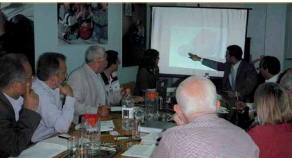
PCHR debrief UN Fact Finding Mission June 2009