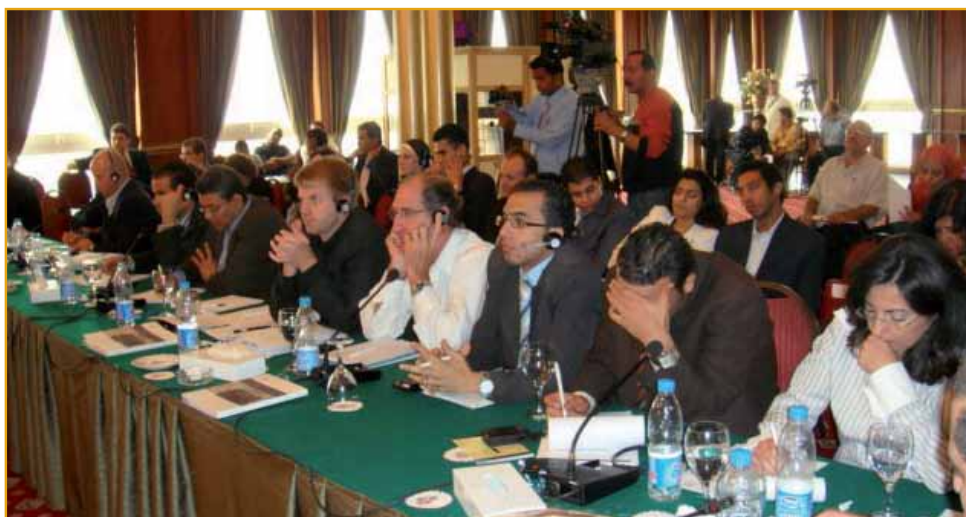
Universal Jurisdiction Conference Cairo, November 2008