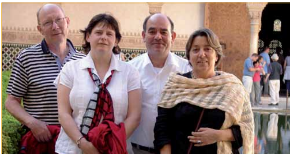
Universal Jurisdiction Conference Malaga, 2006