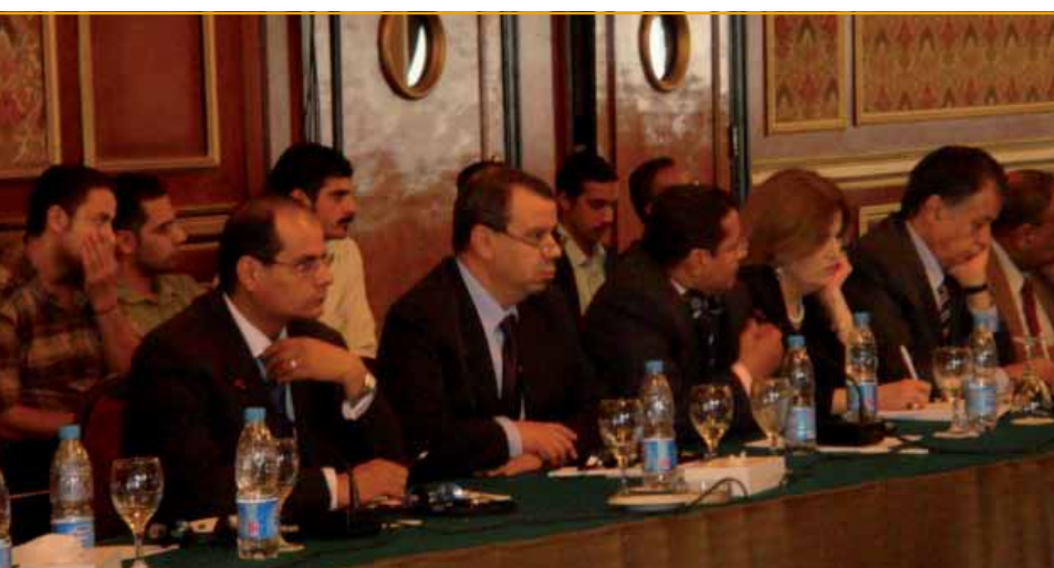
Universal Jurisdiction Conference Cairo, November 2008