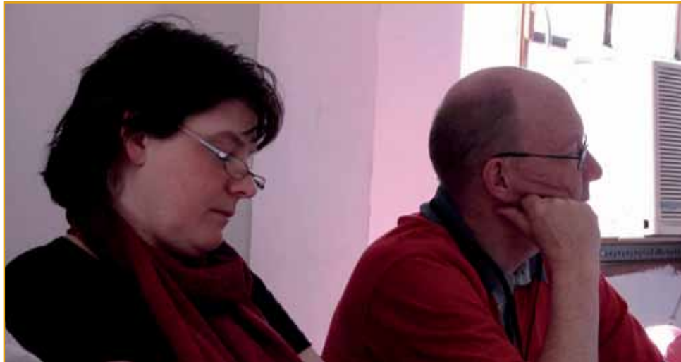
Universal Jurisdiction Conference Malaga, 2006