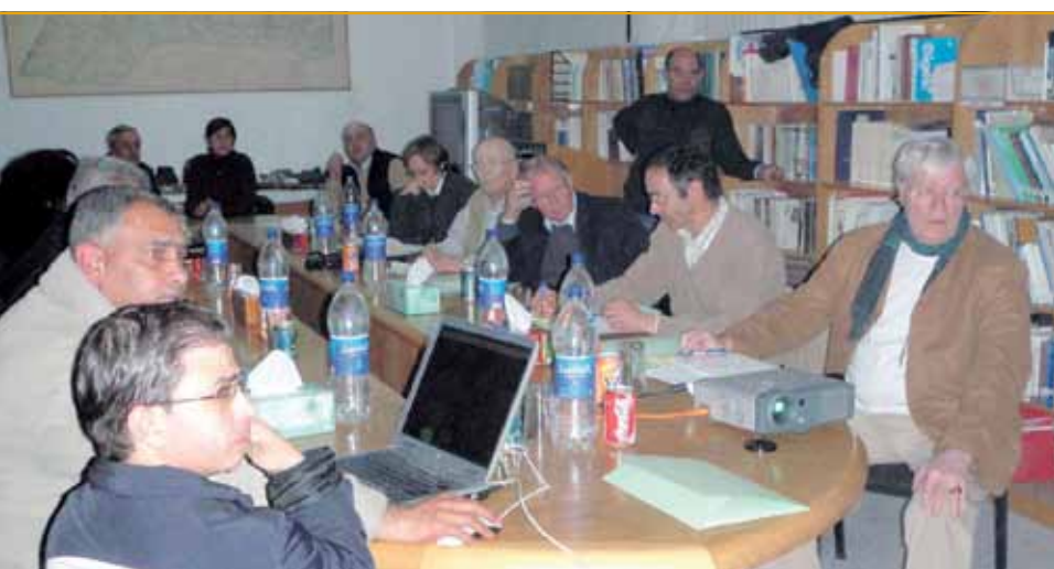
Independent Fact Finding Mission debriefed in PCHR's offices Gaza City, Feb 2009