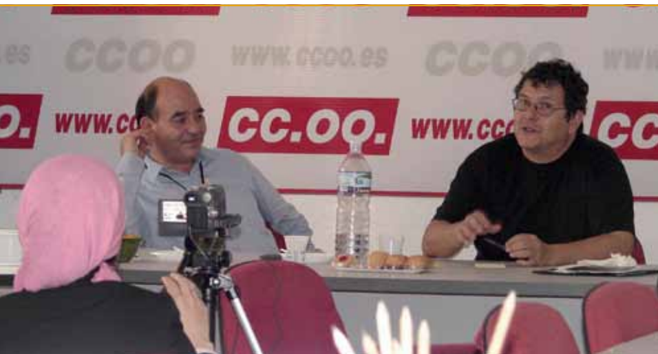
Universal Jurisdiction Conference Malaga, 2006