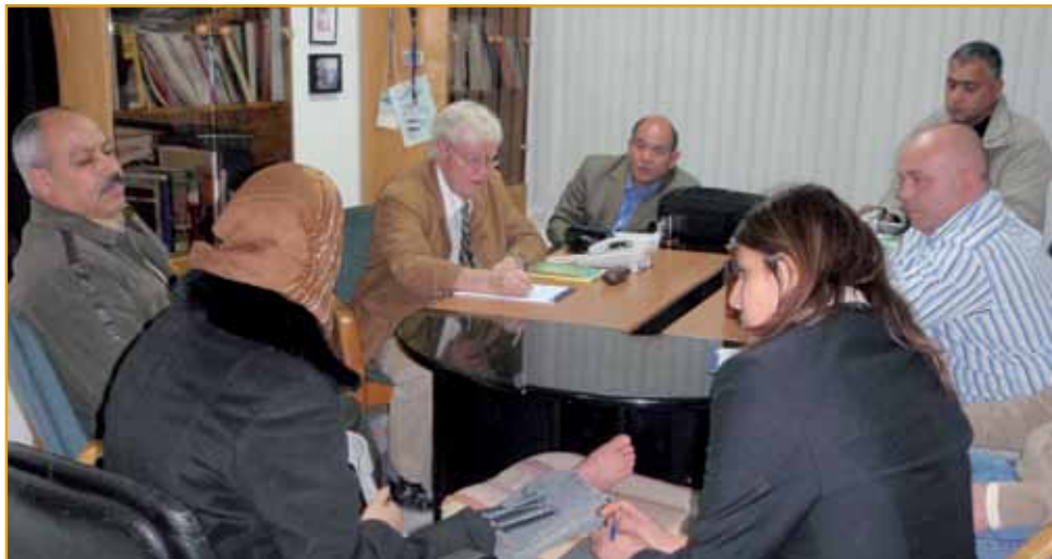
Independent Fact Finding Mission interviewing victim Feb 2009