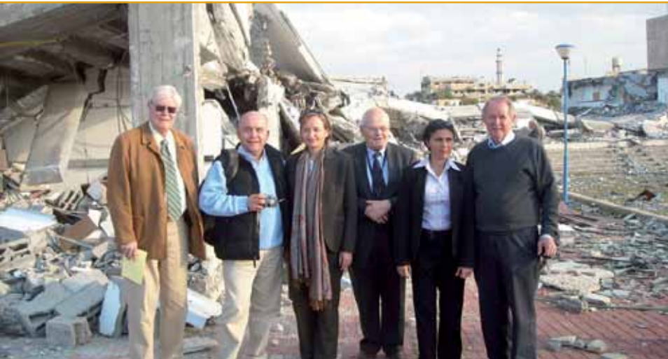
The Independent Fact Finding Mission of the League of Arab States, Feb 2009