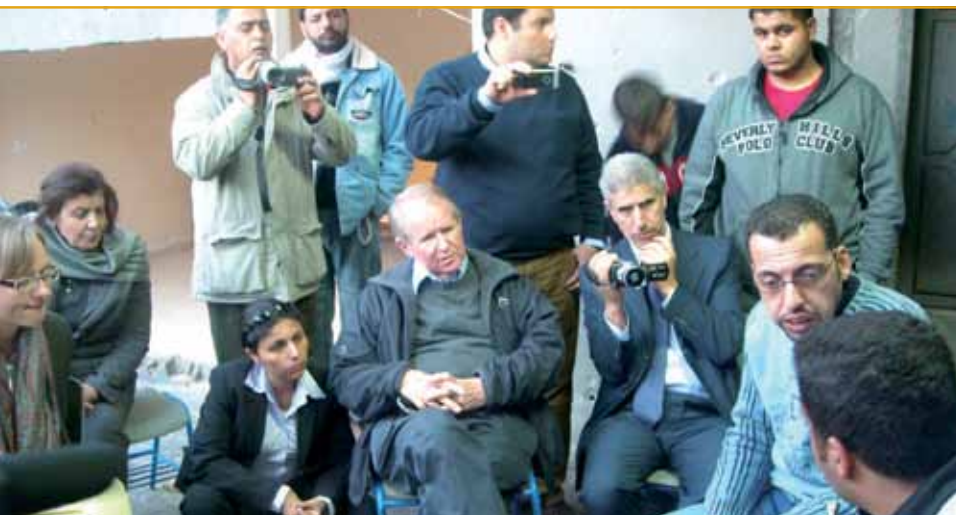
Independent Fact Finding Mission interview victims Feb 2009