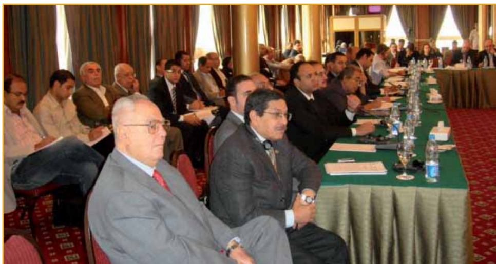
Universal Jurisdiction Conference Cairo, November 2008