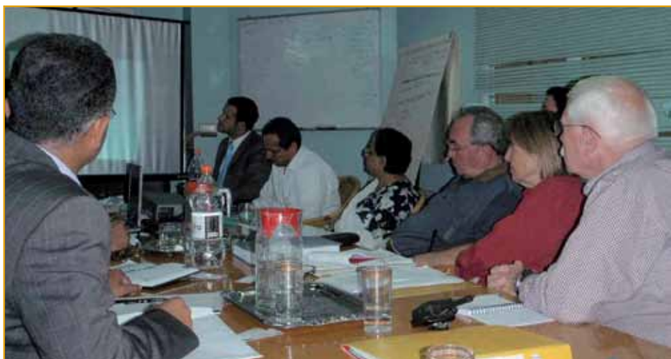
UN Fact Finding Mission on the Gaza Conflict, PCHR June 2009