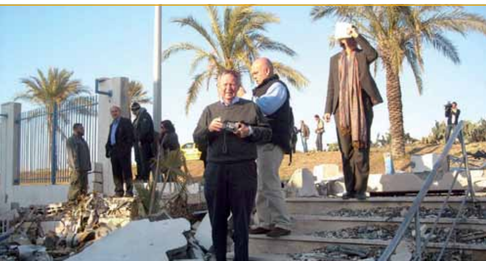
Independent Fact Finding Mission surveys destruction in the Gaza Strip, Feb 2009