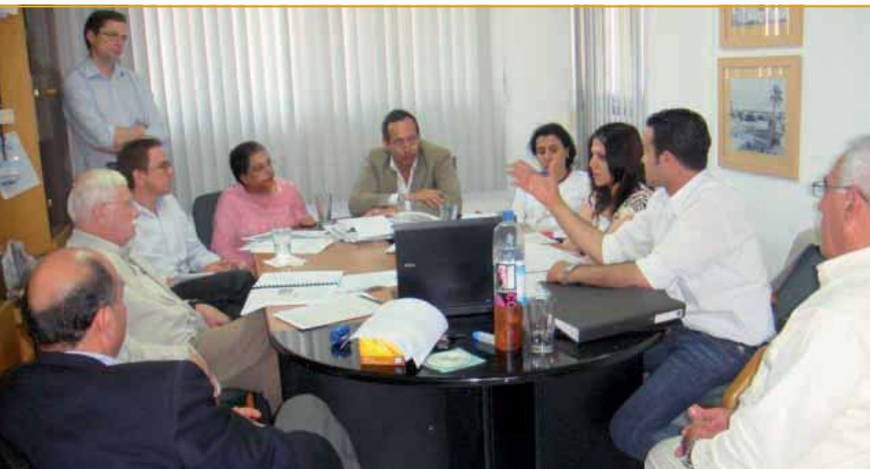
UN Fact Finding Mission on Gaza Conflict June 2009