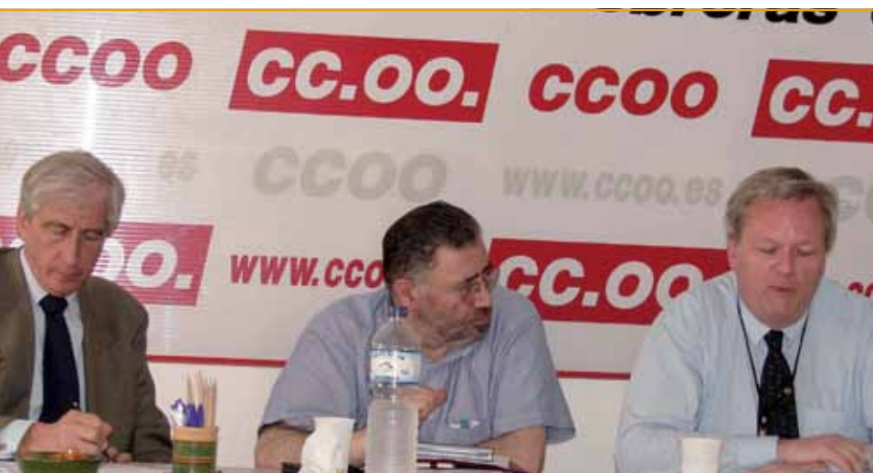
Universal Jurisdiction Conference Malaga, 2006