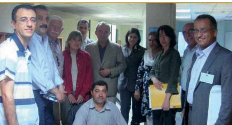
UN Fact Finding Mission on the Gaza Conflict, and PCHR June 2006