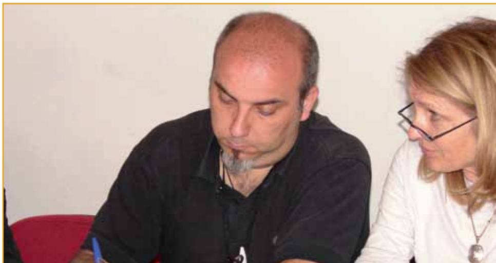
Universal Jurisdiction Conference Malaga, 2006