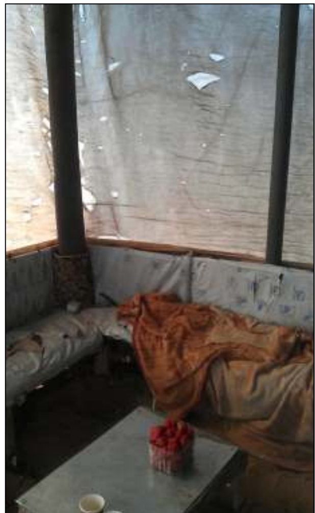
Bullet and shrapnel holes in the cover of the sitting area in Khdeir's farmland are evidence of previous attacks by Israeli forces located on the border north of Beit Lahiya

The perpetrators of attacks against Hatem Khteir's lands are believed to be members of the Israeli Forces (IDF) Southern Command, which is positioned on the armistice line, between the Gaza Strip and Israel. PCHR is unable to further specify the rank and