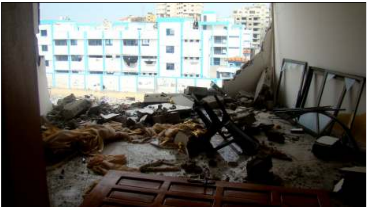
The view from the first floor of Mahmoud al Bahtiti's home, looking at a damaged UN school