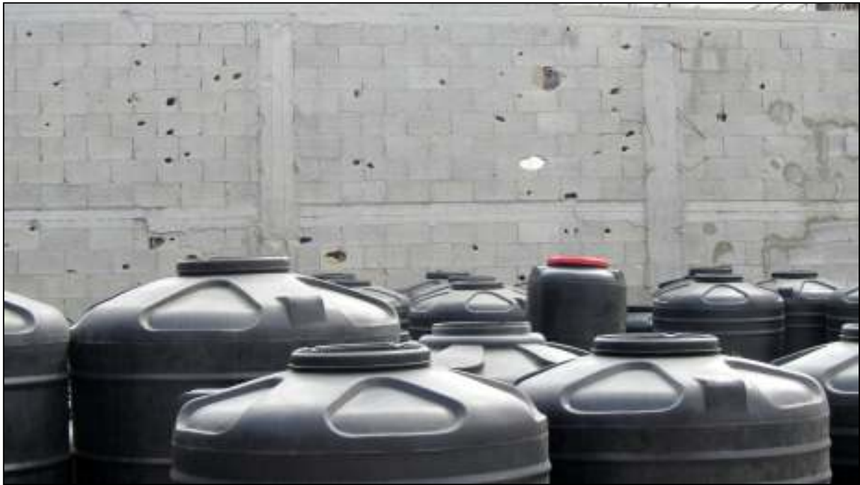
Water tanks produced in al Hatou's factory