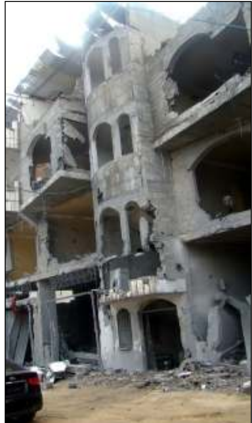
The destroyed building belonging to Mahmoud al Bahtiti

He recalls: "During the first attack, we were all sleeping in the house as it was very early in the morning. When the attack happened, the windows of our house broke from the impact and, as they shattered, pieces of glass fell on some of the children. Because of this, they sustained minor injuries like cuts and bruises. Immediately after the first attack, the Civil Defence team arrived. They were busy trying to control the fire that had erupted in the Ministry Building when the electricity generator in the building burst into flames. The fire was not put out for a long time. After the first attack, my family took shelter with our relatives and friends in other parts of the city. We split up into small groups, as it was impossible for us to find a place where all of us could stay. Some of my sons went to their in-laws' houses with their wives and children."