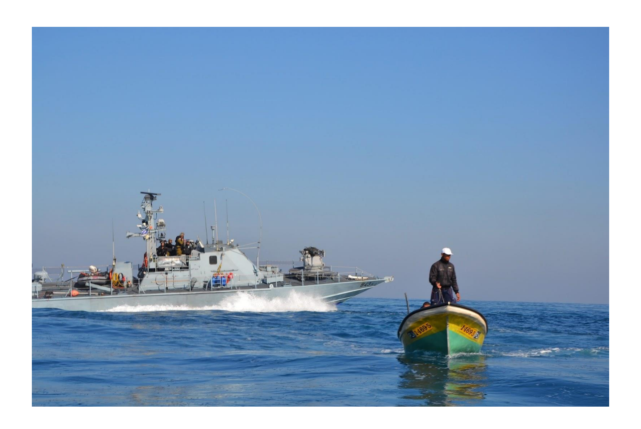
(01 January – 31 October 2016)